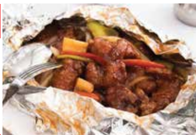
Flame Pork Ribs