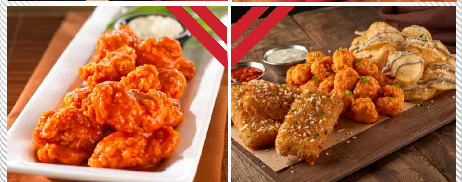
»» BONELESS BUFFALO BITES