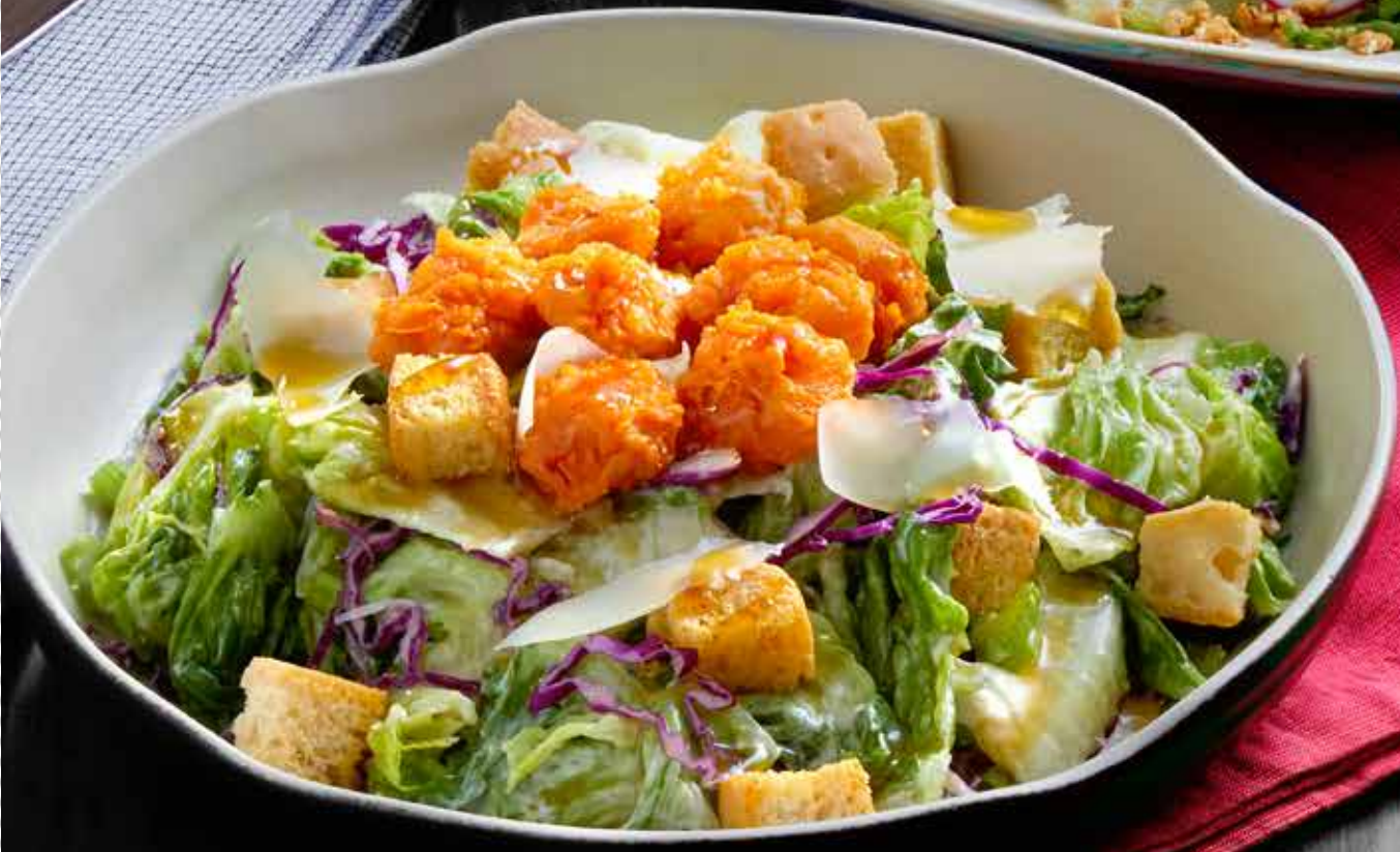
» BUFFALO CHICKEN AND HONEY BLEU CHEESE SALAD