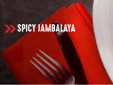
» SPICY JAMBALAYA