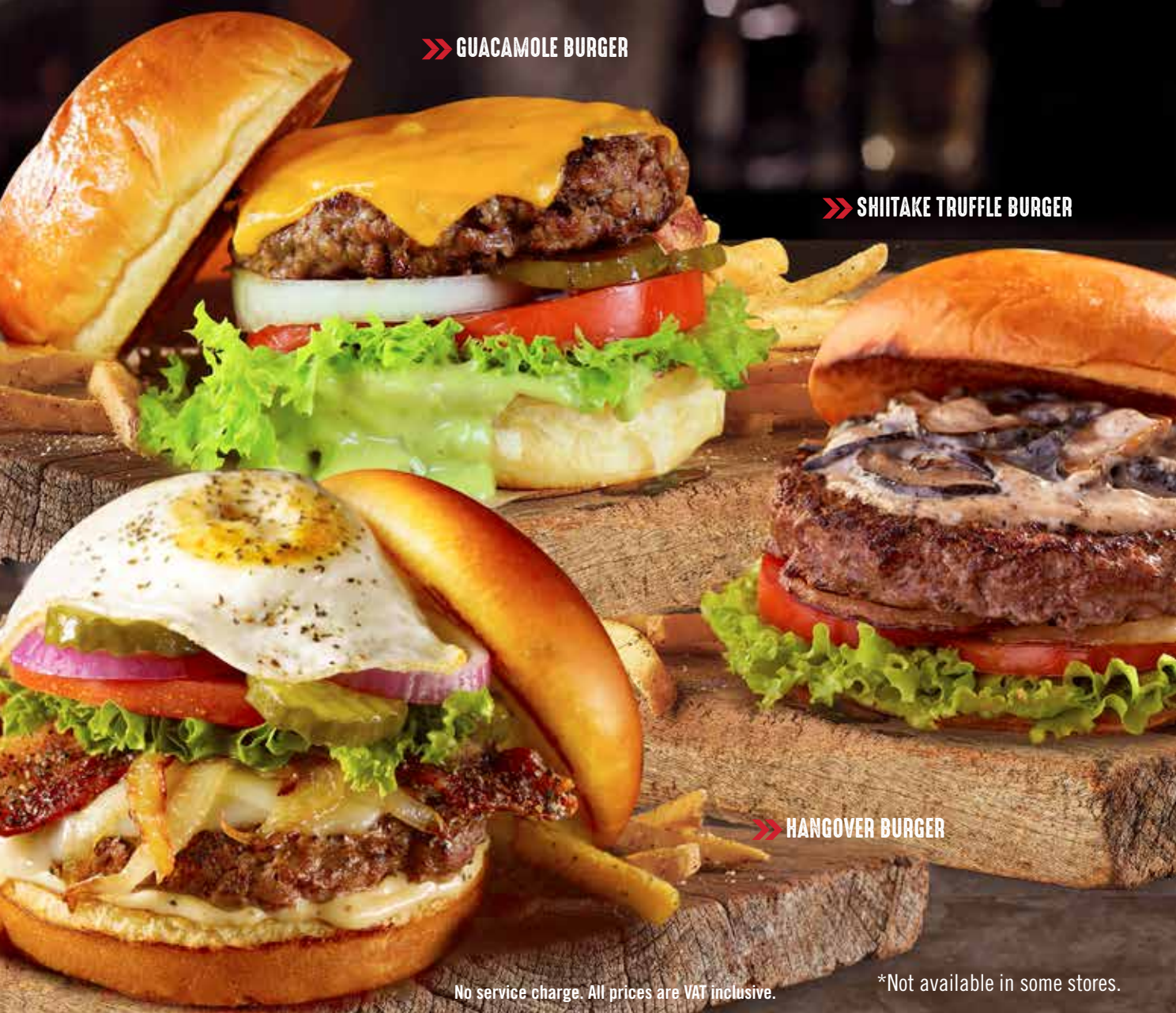
» GUACAMOLE BURGER