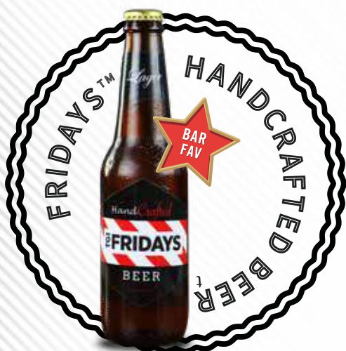
Hand Crafted Beer P275

White Rice Php 60 Garlic Rice Php 75 Cheddar Mashed Potato Php 125