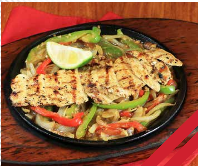
» SIZZLIN' CHICKEN FAJITAS