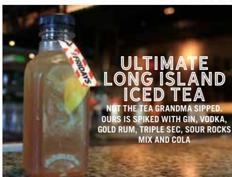
ULTIMATE LONG ISLAND ICED TEA NOT THE TEA GRANDMA SIPPED. OURS IS SPIKED WITH GIN, VODKA, GOLD RUM, TRIPLE SEC, SOUR ROCKS MIX AND COLA

No service charge. All prices are VAT inclusive.