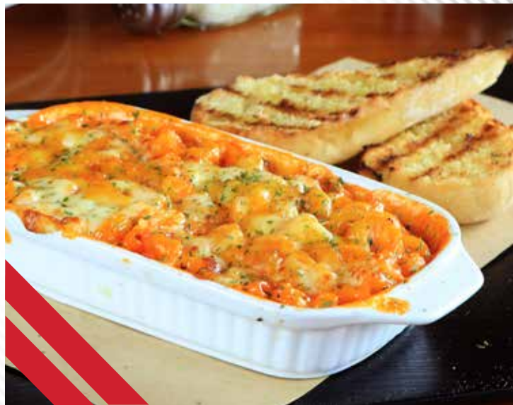
» BAKED MAC AND CHEESE

No service charge. All prices are VAT inclusive.