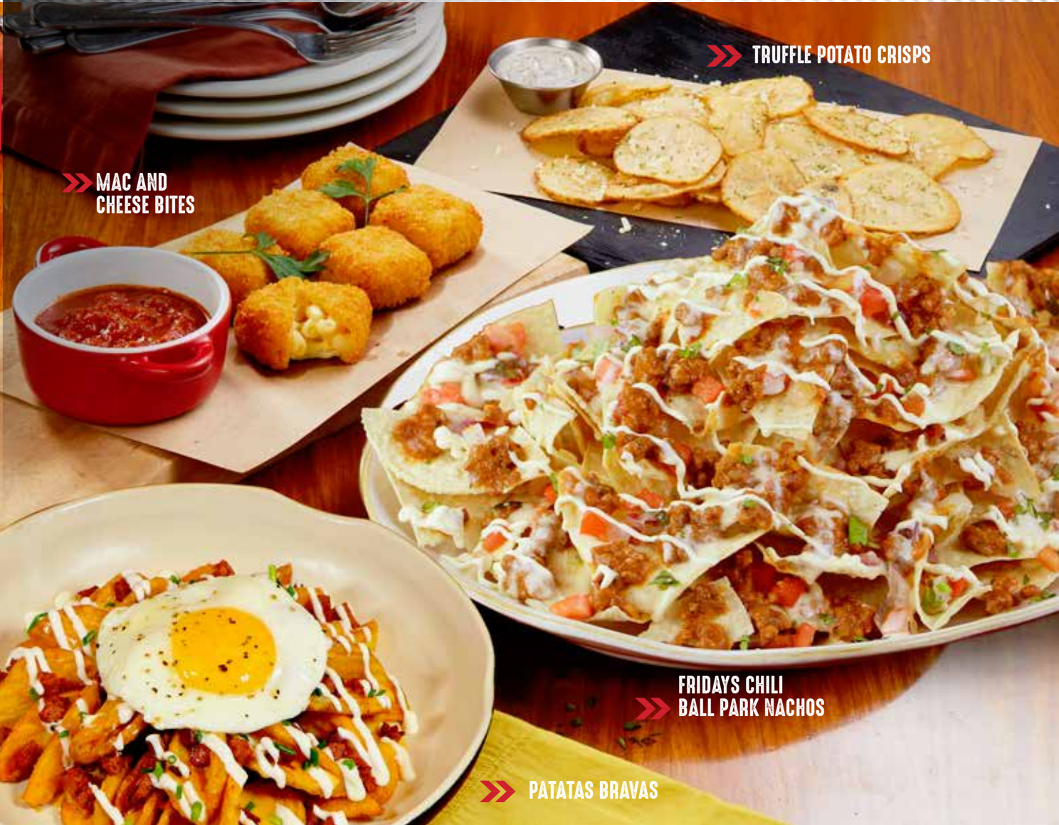
»» MAC AND CHEESE BITES