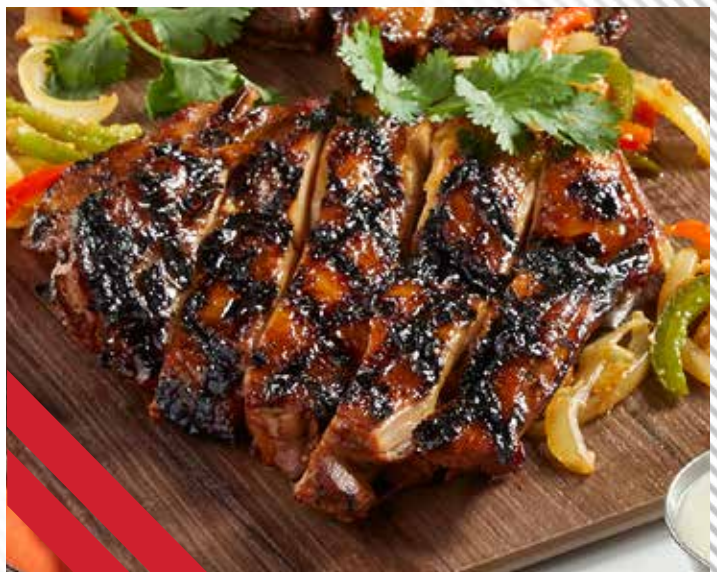
» GRILLED BBQ CHICKEN

No service charge. All prices are VAT inclusive.