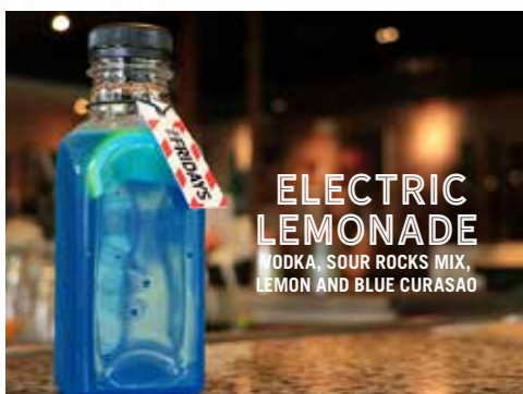
ELECTRIC LEMONADE VODKA, SOUR ROCKS MIX, LEMON AND BLUE CURASAO