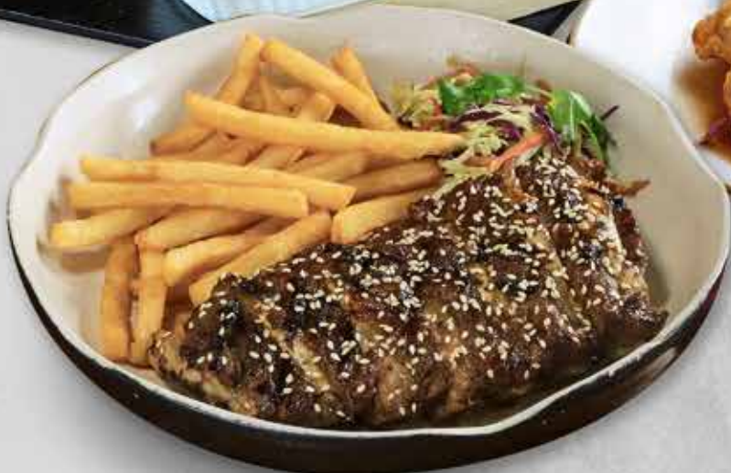
Oriental Ribs (half Rack)