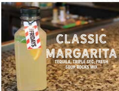
CLASSIC MARGARITA TEQUILA, TRIPLE SEC, FRESH SOUR ROCKS MIX