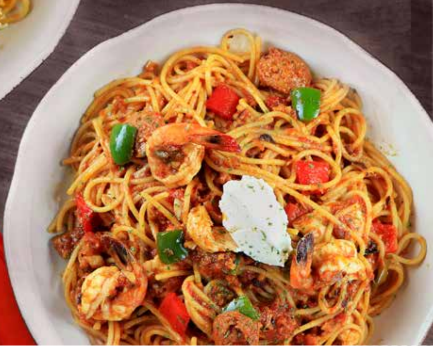
» SPICY JAMBALAYA