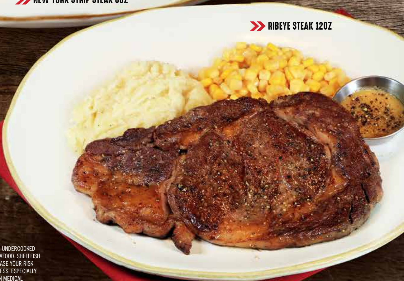
»» RIBEYE STEAK 120Z

CONSUMING RAW OR UNDERCOOKED MEATS, POULTRY, SEAFOOD, SHELLFISH OR EGGS MAY INCREASE YOUR RISK OF FOODBORNE ILLNESS, ESPECIALLY IF YOU HAVE CERTAIN MEDICAL CONDITIONS. OUR DISHES ARE COOKED TO ORDER.