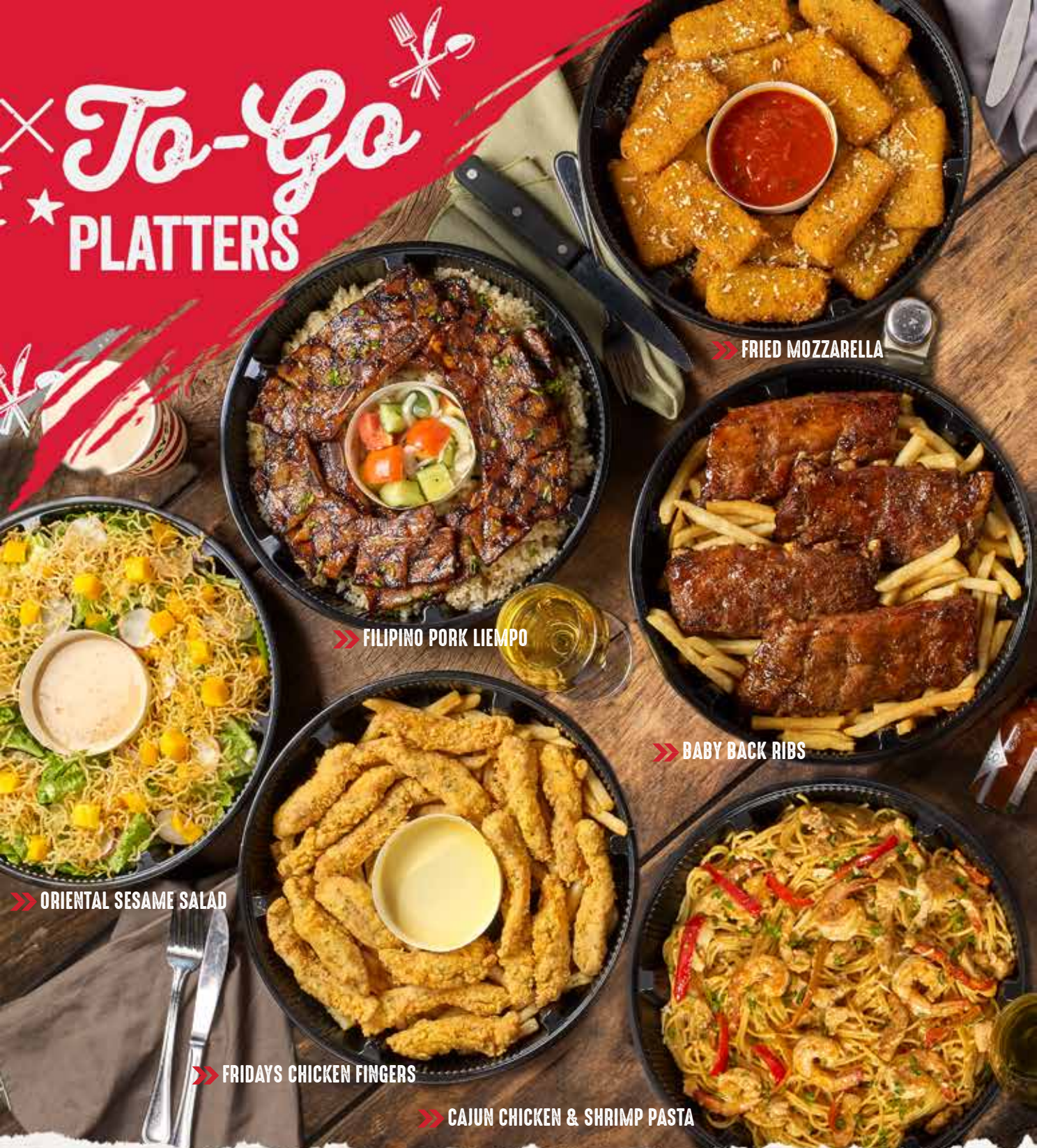
» FRIED MOZZARELLA