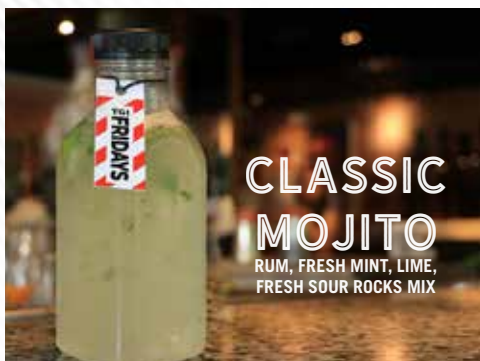
CLASSIC MOJITO RUM, FRESH MINT, LIME, FRESH SOUR ROCKS MIX