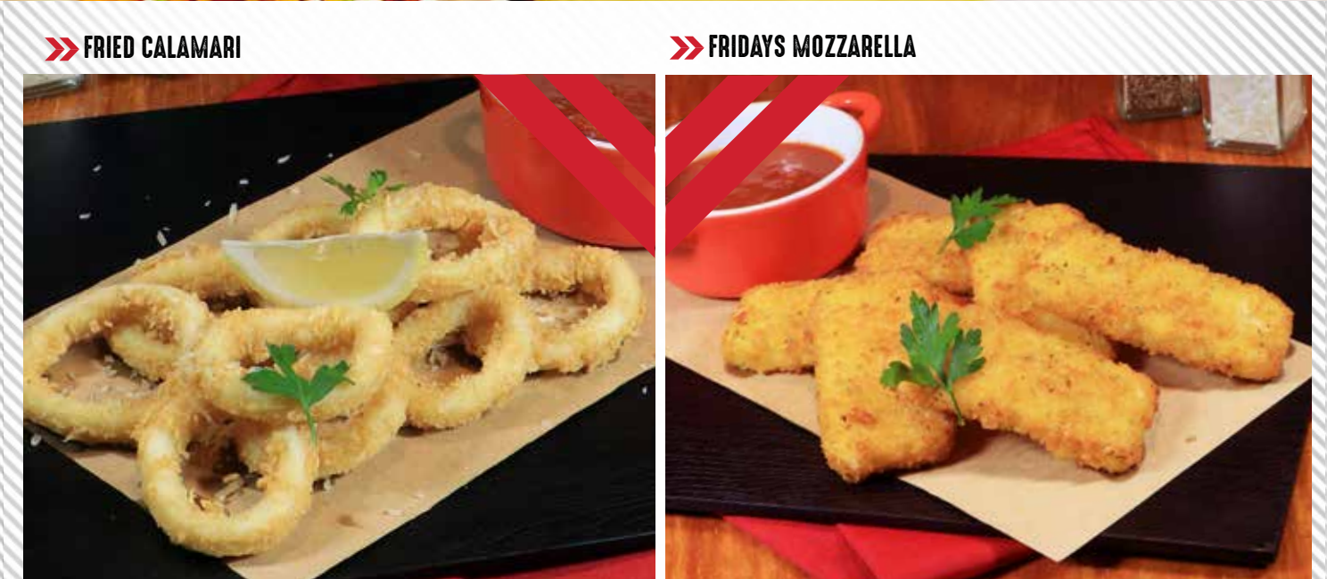
»» FRIED CALAMARI