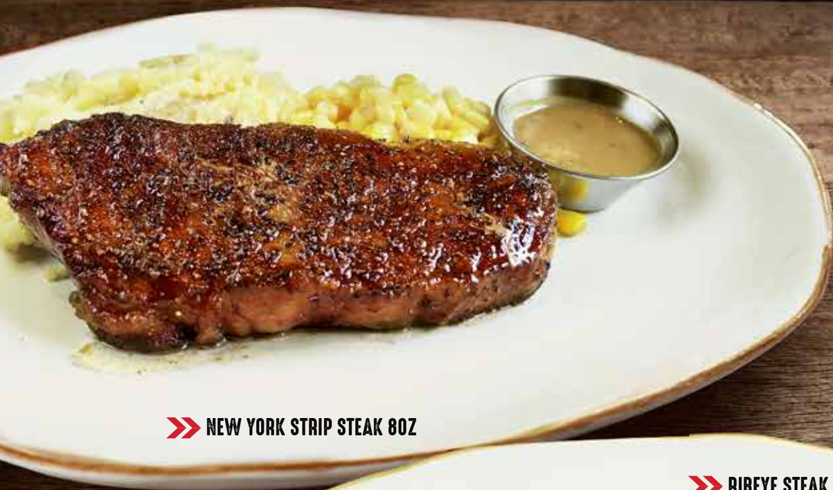
»» NEW YORK STRIP STEAK 80Z