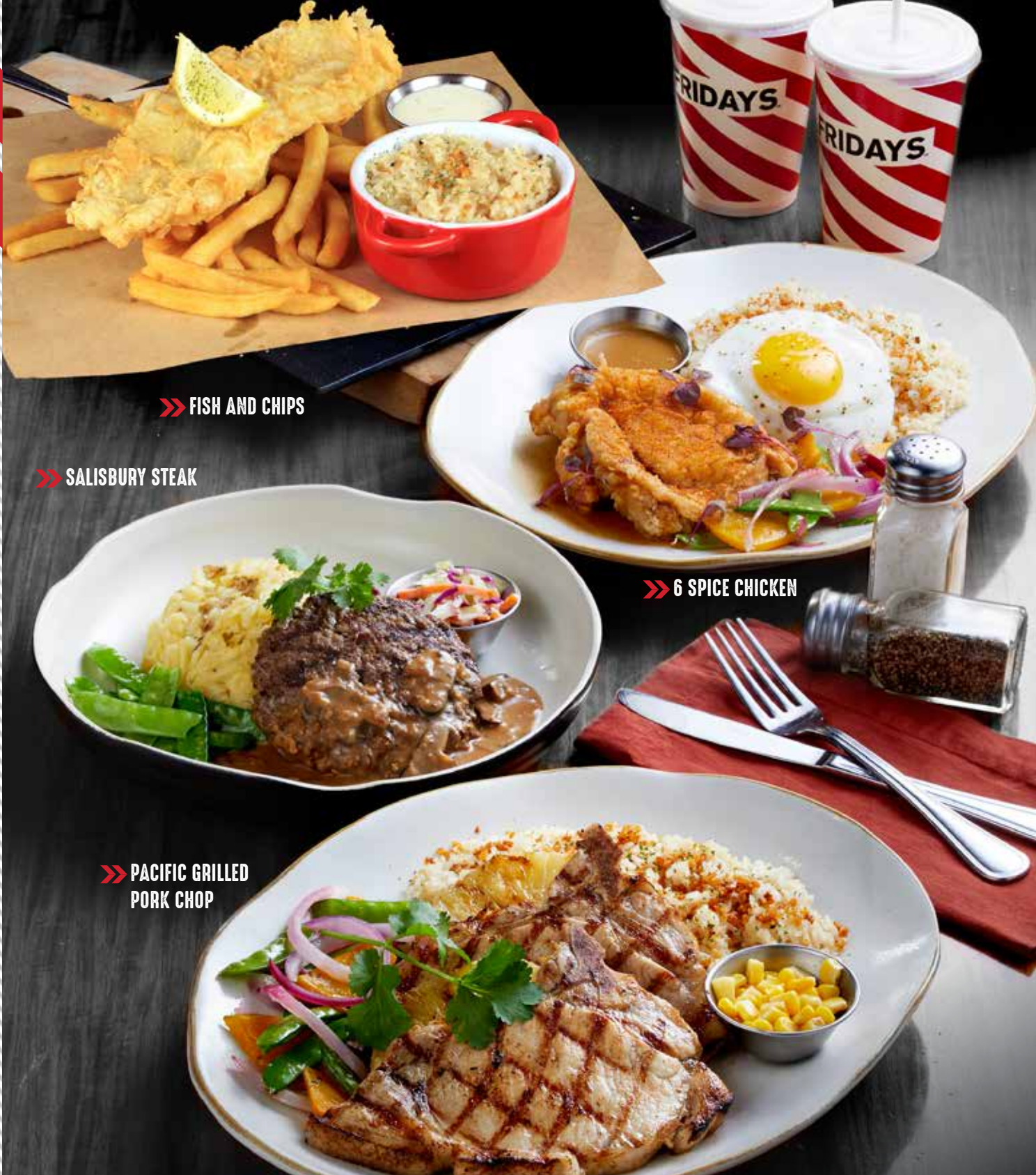
» FISH AND CHIPS