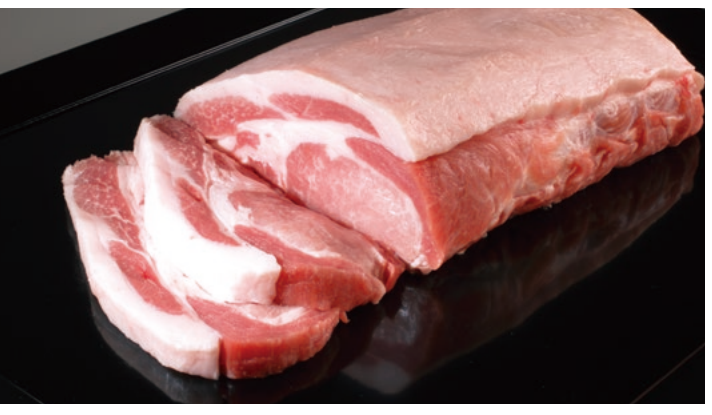
Amai Yuwaku, the original pork brand