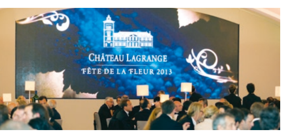
The Great Feast at la Fête de la Fleur held at Château Lagrange S.A.S. in June of 2013