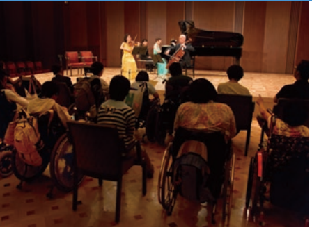
Students from Komei Special Needs School listening raptly to the second movement of Beethoven's Piano Trio in B Flat Major, the Gaussenhauer