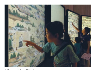
"Omoshiro Bijutsu Wonderland Exhibition"