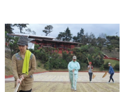
Practicing drying the coffee parchment

In addition to experiencing the differences that climate and terroir can have on the qualities of aroma and flavor of the coffee, they visited clinics the Suntory Group supports and met with several farmers.