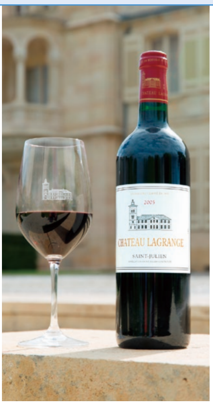
Château Lagrange S.A.S., 2005