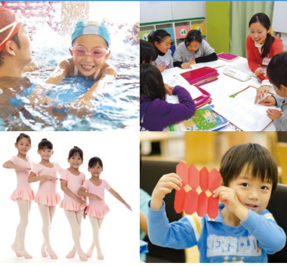
Learning activities for athletic (swimming, ballet) and intellectual (English conversation, arts & crafts) training