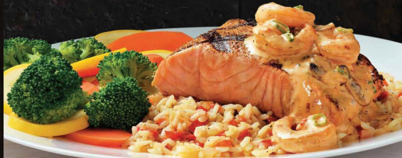
PRAWN TOPPED SALMON

Our perfectly grilled salmon topped with sautéed prawns and button mushrooms tossed in a tomato cream sauce. 39.95