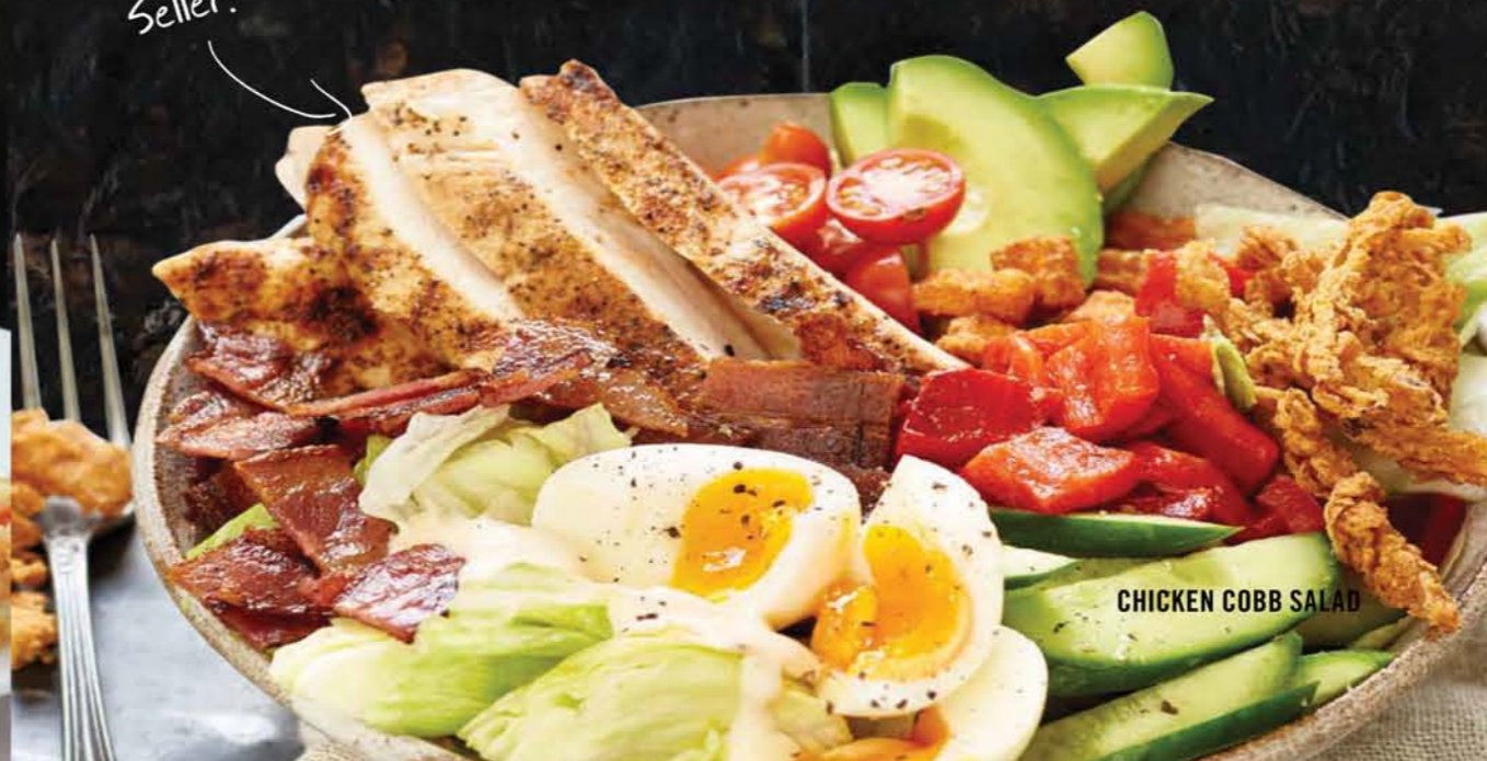
CHICKEN COBB SALAD

1% SURCHARGE WILL BE ADDED TO ALL CARD PAYMENTS