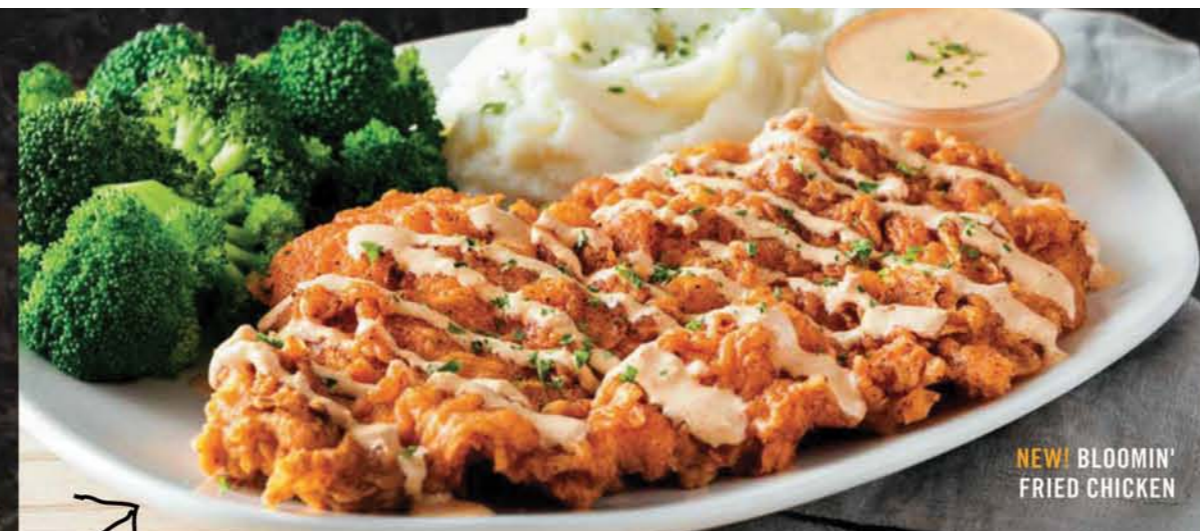
NEW! BLOOMIN' FRIED CHICKEN