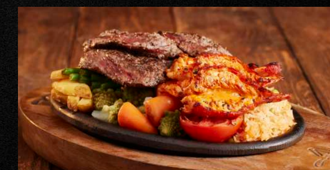
SURF N TURF