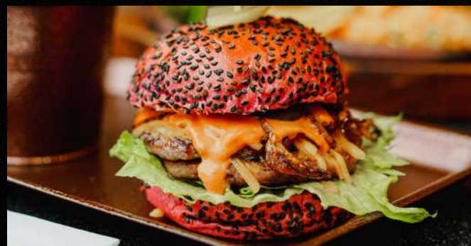
THE TORO'S CLASSIC BURGER