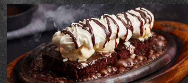
TORO'S SIGNATURE SIZZLING BROWNIE

Delicious chewy chocolate fudge brownie smothered in rich chocolate fudge and chocolate sauce. Served with vanilla ice-cream, whipped cream and chocolate sauce.