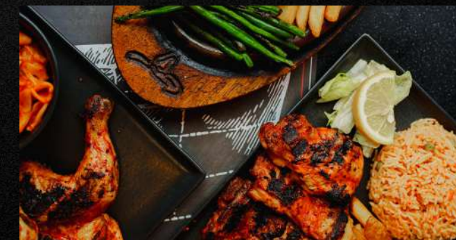
BONELESS CHICKEN THIGHS