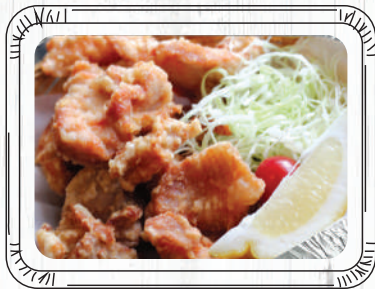
* Deep Fried Boneless Chicken with Seasoned Mayo S - $25 L - $42

Small - serves 4-5 ppl. Large - serves 8-10 ppl*