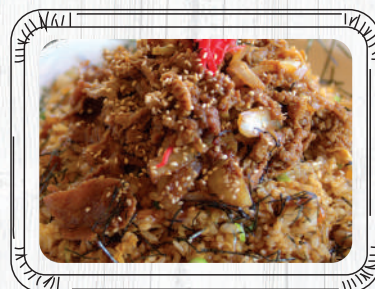
* Fried Rice with Grilled Beef S - $32 L - $59

食物圖片只作參考之用 Dish may not be exactly as shown