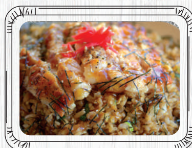
* Fried Rice with Teriyaki Chicken S - $32 L - $59