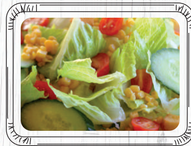
* House Green Salad with Sesame Dressing S - $18 L - $30