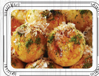
Takoyaki S - $18 (15 pcs) L - $38 (30 pcs)