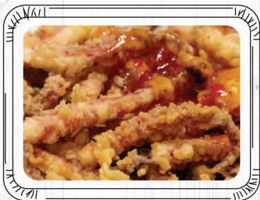
* Deep fried Tentacle in Sriracha Mayo S - $25 L - $42