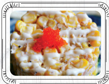
* Marinated Seaweed Salad with Real Crabmeat S - $30 L - $52