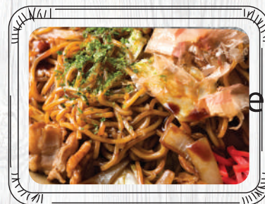
* Pan Fried Noodle with Japanese BBQ Pork & Mixed Veggie (Choice of Noodle/Udon) S - $28 L - $52